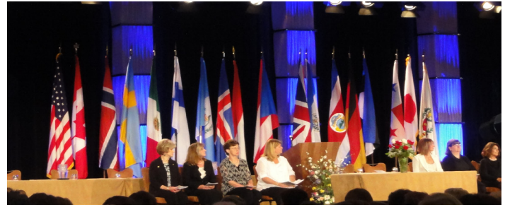
Flags of DKG