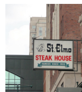
Girls Nite Out at world famous St Elmo Steak House