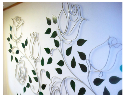
The Rose Wall metal sculpture