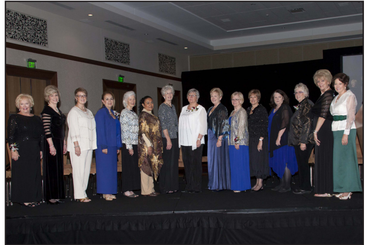
Newly Installed 2014-2016 International Administrative Board