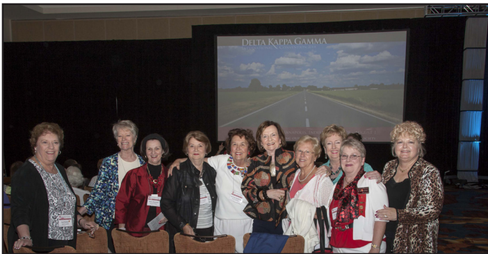
Photographer Jim snapped a photo of the NC delegates during a business session break.