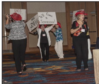
Come to Tennessee in 2016!

All photos on this page Courtesy of Photographs by Jim, Floresville, TX