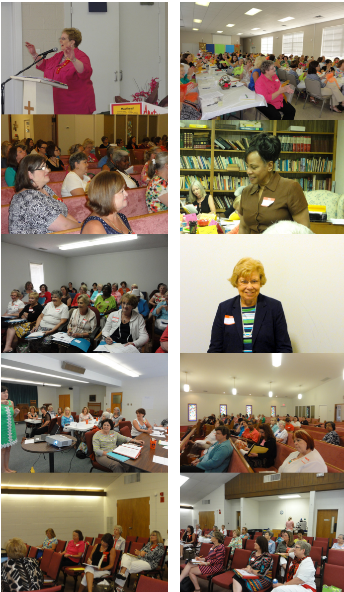
Scenic views of the Eta State's new leaders.

A few of their comments are presented here for your enjoyment.