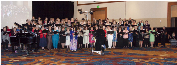
Convention Chorus with NC participants