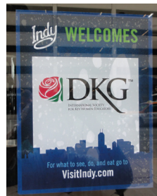
Indianapolis businesses welcome DKG